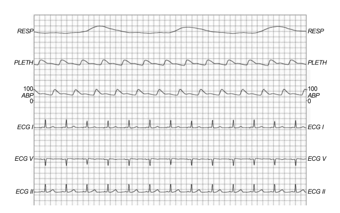
Fig. 3. An example of high-resolution waveforms. RESP: respiration, PLETH: plethysmogram, ABP: arterial blood pressure, ECG: electrocardiogram.

ICD-9: International Classification of Diseases 9th Revision, DRG: Diagnosis Related Group, IV: intravenous, ECGs: electrocardiograms, CPT: Current Procedural Terminology, SAPS: Simplified Acute Physiology Score, SOFA: Sequential Organ Failure Assessment.